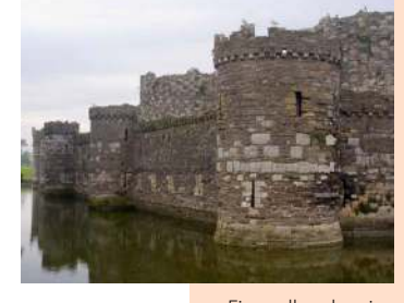
Firewalls: a barrier to entry

If you're connecting to the internet through a wireless network,