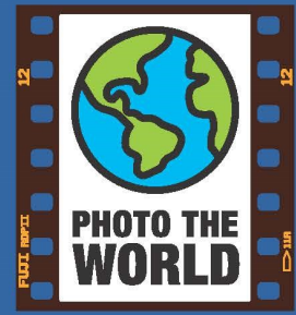
PHOTO THE WORLD

Take a photograph and win an Amazon voucher, and see your photo published in the “Photo the World” calendar!