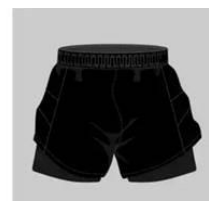
Boys/Girls Shorts Examples – available at Clubsport