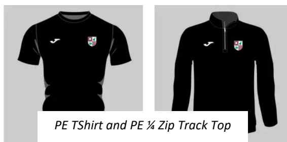
PE TShirt and PE ¼ Zip Track Top

The following items are required unbranded items (without school logo):